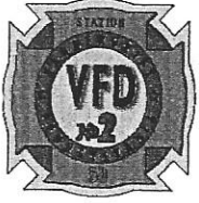
Exhibit - 3

Vandergrift Fire Department No. 2 229 Emerson Street Vandergrift, PA 15690